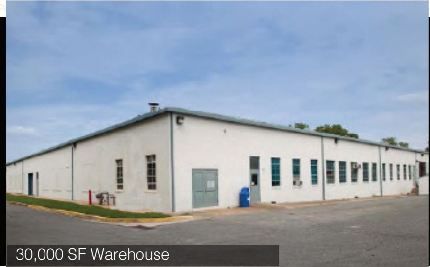
30,000 SF Warehouse