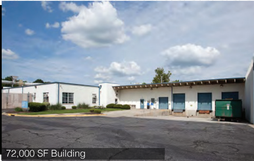
72,000 SF Building