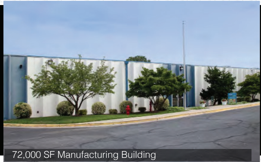
72,000 SF Manufacturing Building