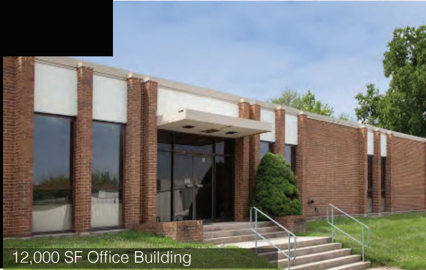
12,000 SF Office Building

9207 51st Avenue College Park, Maryland 20740